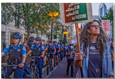
Chicago DNC Protest